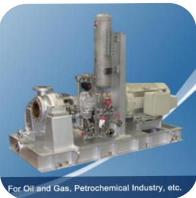
For Oil and Gas, Petrochemical Industry, etc.

Size / Model: 300 / 250 BDMF-HR6 Design Point: 7905m 3 /h 1181m 3550kW