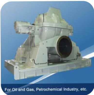
For Oil and Gas, Petrochemical Industry, etc.

Size / Model: 450mm VPFC Design Point: 2100m 3 /h 102m 900kW