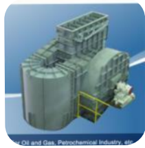
MODEL FT2B Single Suction 2-Stage Centrifugal Fan Oil and Gas, Petrochemical Industry, etc.