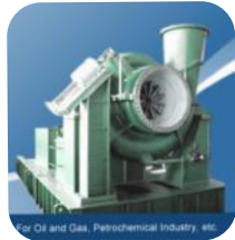
MODEL BHOP Single Suction Integrally Geared Centrifugal Blower For Oil and Gas, Petrochemical Industry, etc.