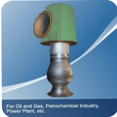
For Oil and Gas, Petrochemical Industry, Power Plant, etc.