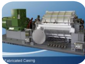
MODEL BTnP Single Suction Multi Stage Centrifugal Blower Fabricated Casing