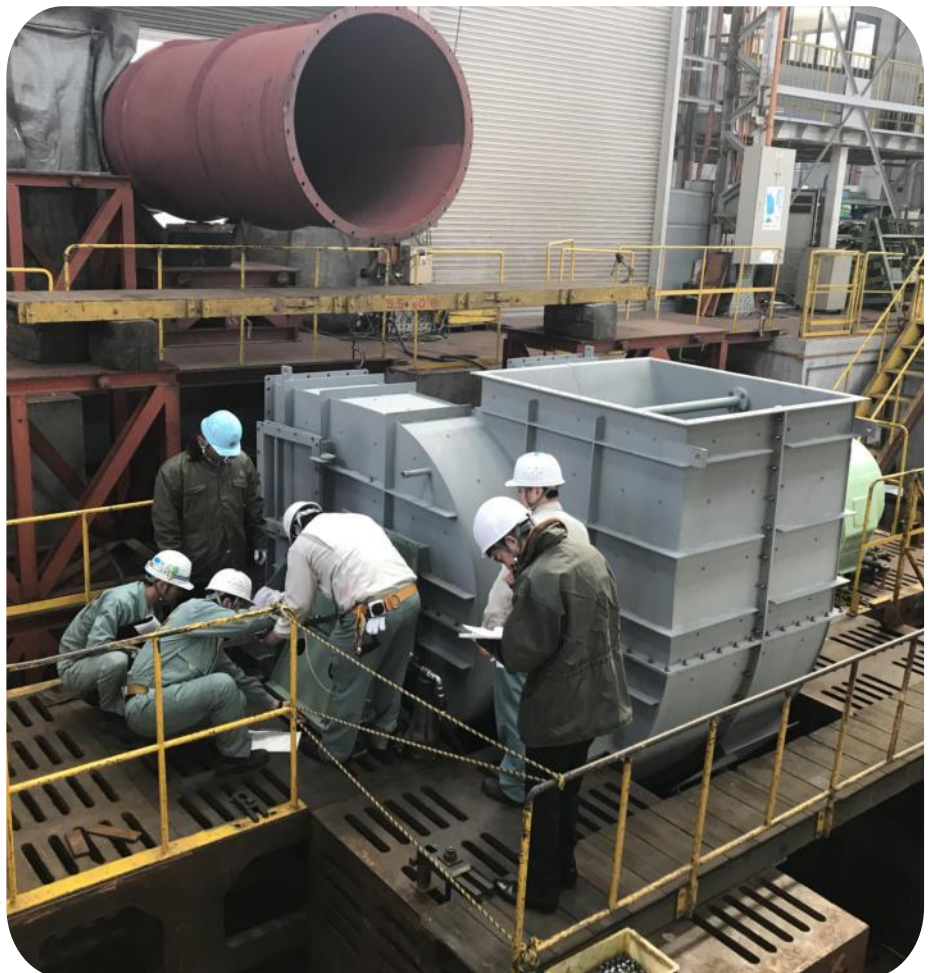
MODEL #9 FTDB-CNM (3,100m 3 /min, 185 mmAq 180kW/6p) Induced Draft Fan Measurement Check during Witnessed Inspection by Customer in February 2018. *Origin: Japan

Distribute By EST MECH PTE LTD, SINGAPORE