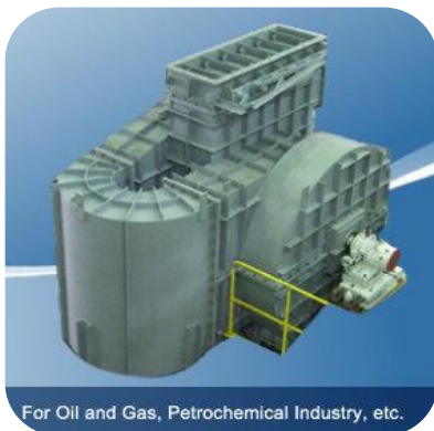
For Oil and Gas, Petrochemical Industry, etc.

Design Point: 16960m 3 /min 13.72kPa 4800kW