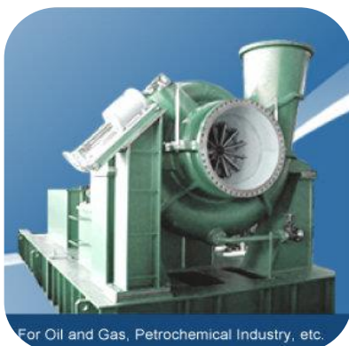
For Oil and Gas, Petrochemical Industry, etc.