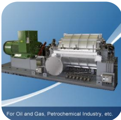
For Oil and Gas, Petrochemical Industry, etc.

Design Point: 1230m 3 /min 35.5kPa 1050kW