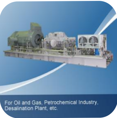
For Oil and Gas, Petrochemical Industry, Desalination Plant, etc.

Size / Model: 1200 / 1000 DF-S Design Point: 243m 3 /min 35m 1800kW