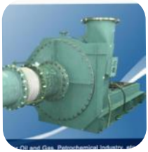
MODEL BIOP Single Suction Single Stage Centrifugal Blower Oil and Gas, Petrochemical Industry, etc.