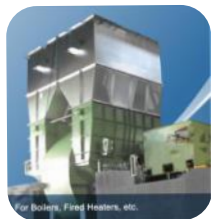
MODEL U-Fan Single or Double Suction Centrifugal Fan For Boilers, Fired Heaters, etc.