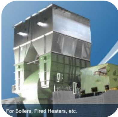
For Boilers, Fired Heaters, etc.